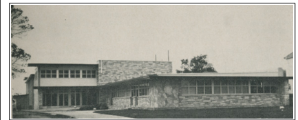
Civic centre then ...

The Springwood area is known for the excellent quality of its sandstone and in fact the gates of Bathurst Prison were erected from sandstone quarried from this area. Plans for the proposed Memorial Hall still exist in council local studies collection.