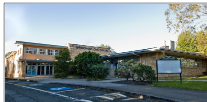
Civic centre now ...